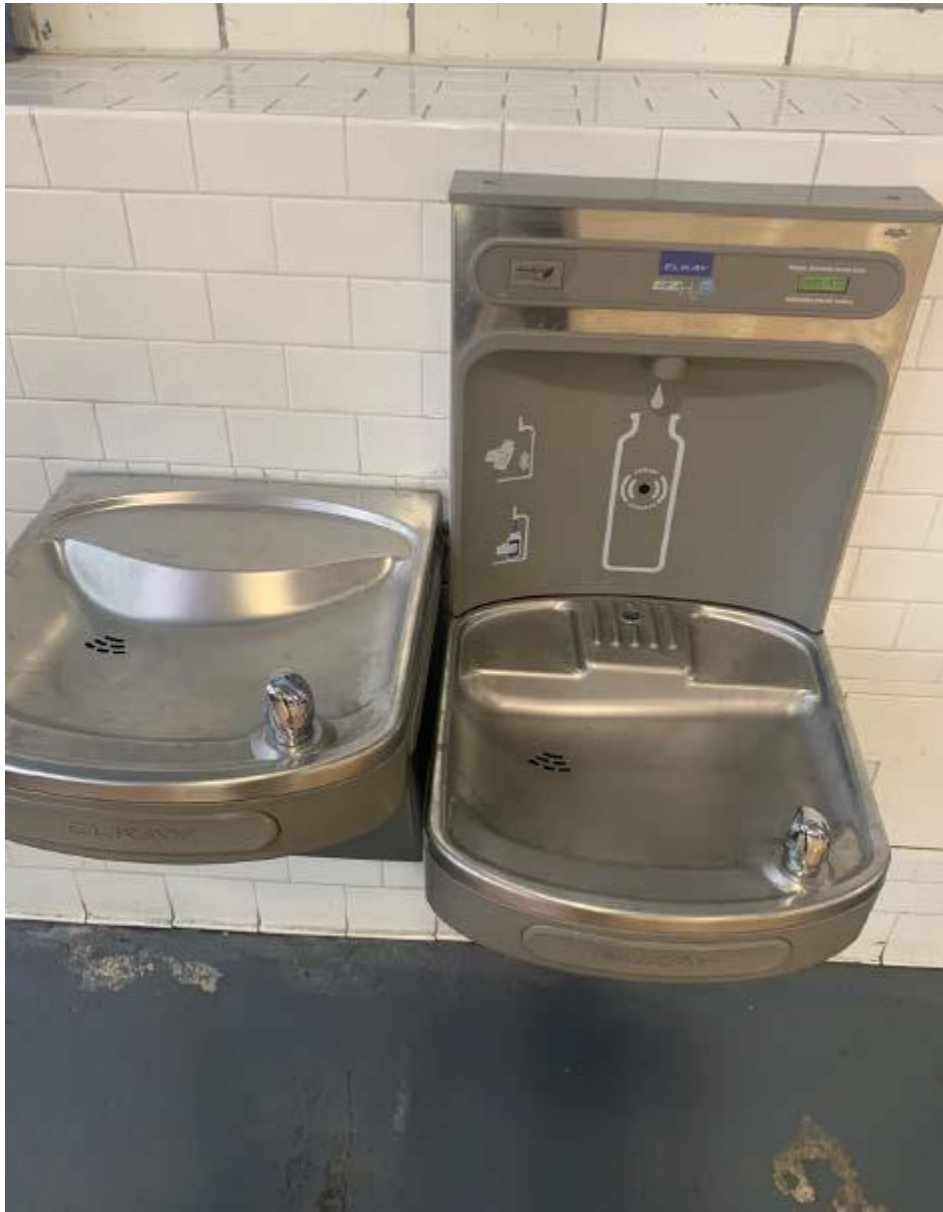
Examples of Current Asset Tags